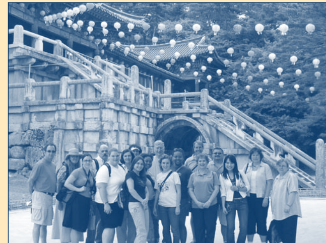
The MSU Discover Korea team stands in front of the Bulguksa Buddhist temple on one of their sight-seeing trips.