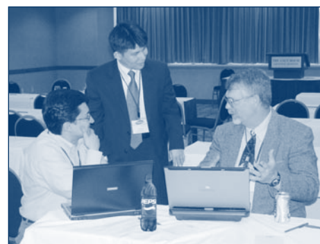
ITERA provides opportunities for TSM faculty to share ideas with faculty from universities all over the nation.

and the advancement of telecommunications as an academic discipline by creating a forum for academics and industry to collaborate. Murray State has been a key player in founding the ITERA organization as it was formed from the original MSU TSM annual conference in Louisville, Ky., when many academic attendees recognized the need for a working association between universities with telecom programs. The 2008 ITERA Educational Conference is already planned for March of 2008 in Louisville.