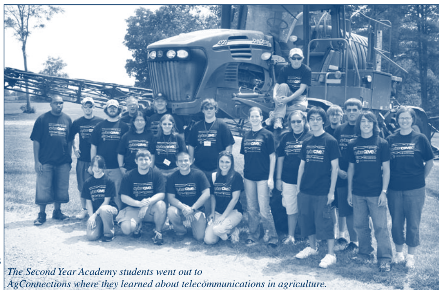
The Second Year Academy students went out to AgConnections where they learned about telecommunications in agriculture.