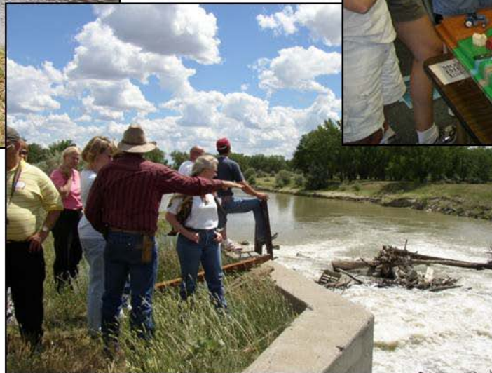
Know Your Watershed Tours