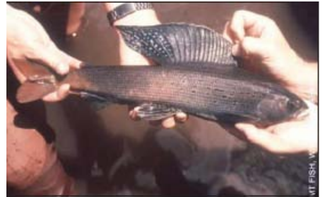
Arctic grayling from the Big Hole River