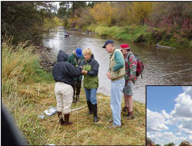
Volunteer Water Quality Monitoring