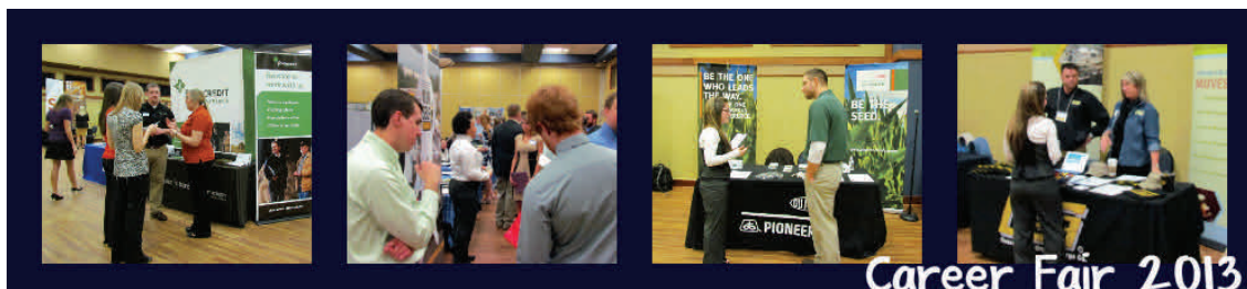
Career Fair 2013

The Hutson School of Agriculture and the Agriculture Leadership Council hosted the Agriculture Career Fair on February 6, 2013. Over thirty companies were represented this year at the career fair, and approximately 300 agriculture students attended the event. This annual event gives MSU Agriculture students the opportunity to interact with representatives from companies covering a wide range of agriculture-related careers. Many companies also conduct on-site interviews for open positions and summer internships.