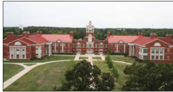
The Science Complex at Murray State University includes the Jesse L. Jones Family Clock Tower which connects the Biology Building on the right with Jesse D. Jones Hall (Chemistry Building) on the left.