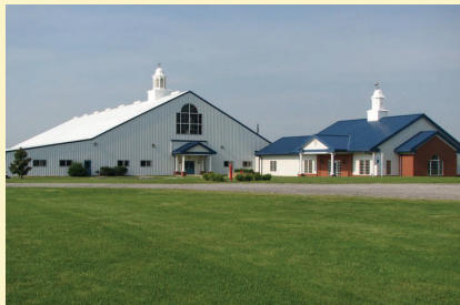
Murray State Equestrian Center

The extracurricular equine activities at MSU are one of the many ways in which MSU graduates earn not only a degree, but an education. The IHSA Hunt, IHSA Stock, and Dressage teams each provide unique opportunities for students to apply the skills they learn in class in a fun and competitive environment. Team membership assists students not only in developing riding skills, but also in developing the sportsmanship, leadership, and organizational skills necessary to be successful professionals in equine careers.